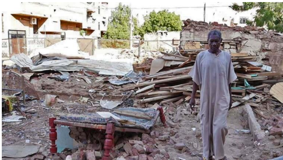
Indiscriminate bombing in Khartoum has destroyed countless neighbourhoods. A family's home destroyed.